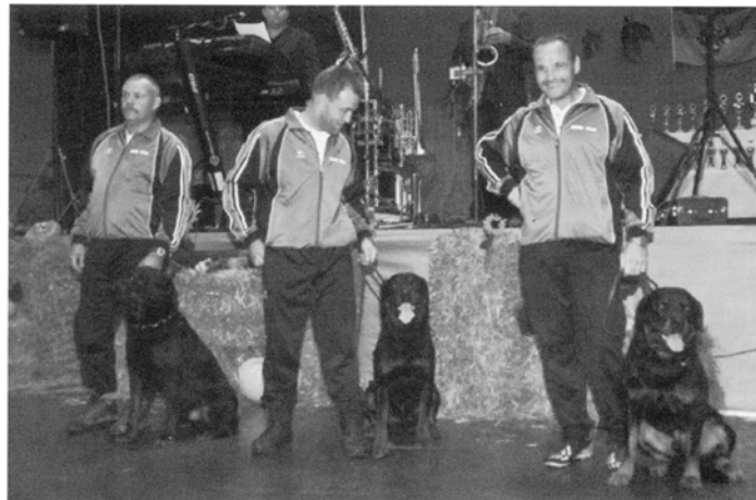
The Top Three

We traveled to Germany on Thursday to be there well in time and to meet up with some friends before the weekend. Lufthansa managed to put a bit of a damper on our trip by losing our luggage on a domestic flight in from Frankfurt. After tens of phone calls and several empty promises by the airline as to approximate delivery time, we finally got our luggage on early Friday afternoon, over 24 hours after landing. And to think that Frankfurt was only a 3-hour drive away! Not a great way to begin a trip. Of course there was an upside to this delay – we just HAD TO do some shopping!